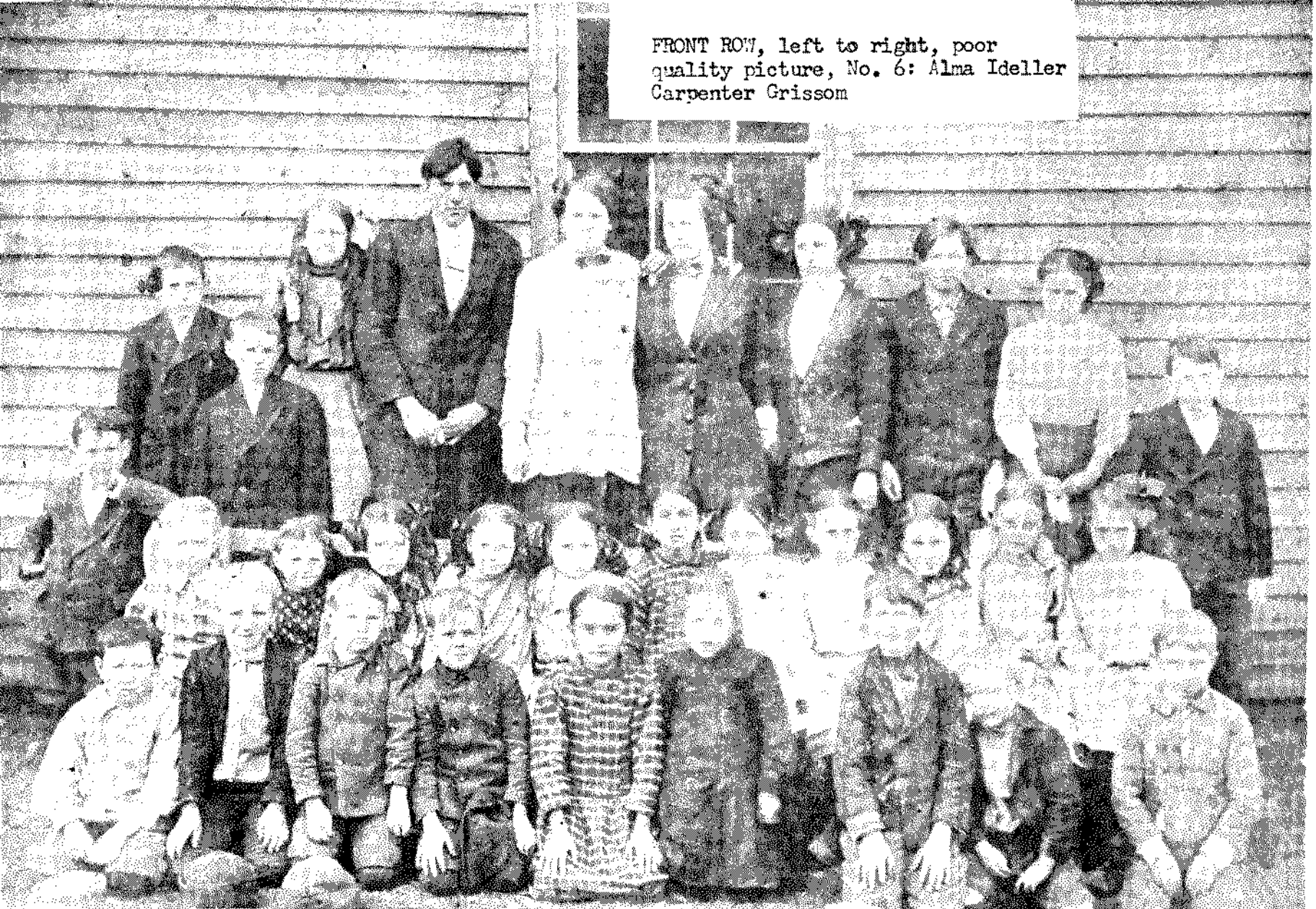
Bethel School, Colbert County, Ala- bama, about 1912